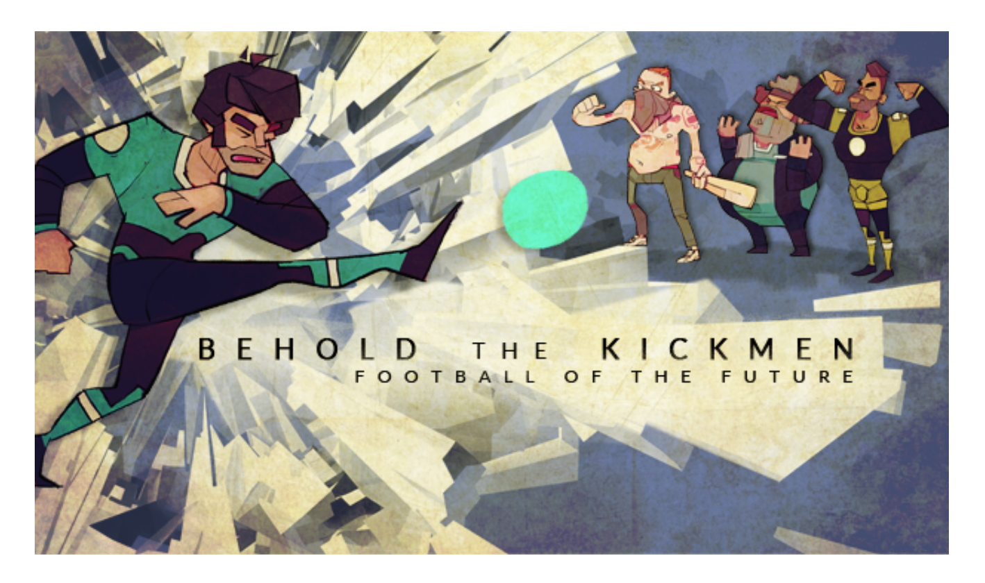
TWO WAYS TO PLAY! Hate football? No problem! The entire game can be re-skinned at the flip of a switch into a Dystopian Future Bloodsport!

PLEASE NOTE: Kickmen has NO ONLINE MULTIPLAYER and NO LOCAL MULTIPLAYER, it's Single Player ONLY. Please don't buy it thinking it's at all sociable, because it isn't. Why, you ask? Because I wanted to make a Single Player game, I didn't want to make a Multiplayer game.